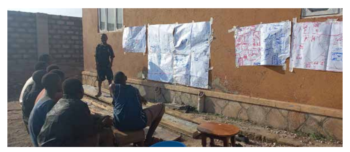
Figure 2 A group of boys discussing their community maps

In addition to learning from peer researchers, young people who participated in the activities were able to learn from one another about their communities. For example, during the Child Protection Community Mapping activity, a child voiced concern over an electric wire and other children learned that clothes should not be hung on them at risk of being electrocuted. Children shared different tips to respond to situations further deepening collective learning.