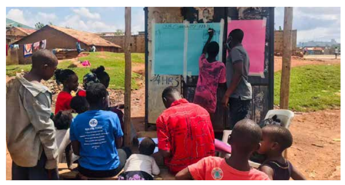
Figure 4 The team utilizing available spaces to conduct research activities

For children who are permitted to be together all the time, it was challenging to maintain six feet distance. In addition, the lack of adequate facilities in the field meant that children had to share their seats, and as such, it was not possible to practice social distancing. In certain contexts, engaging with children online is challenging with lack of internet connectivity and socioeconomic conditions. For example, many of the children involved in the research did not have phones or gadgets to engage in remote connectivity. As such, safe in-person adaptations were more effective than remote engagement.