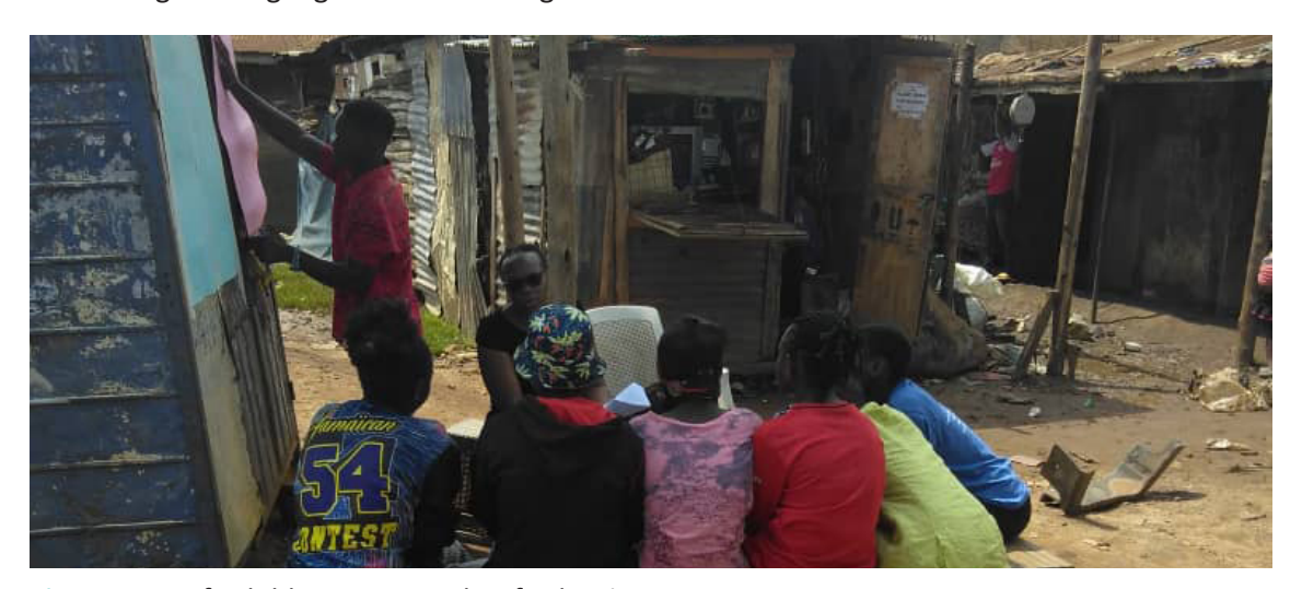
Figure 1 An AfriChild peer researcher facilitating a session

The AfriChild team worked in partnership with youth peer researchers to facilitate the tool piloting. The researchers highlighted the critical value of peer researchers to stimulate conversations and foster trust. Children and young people felt more comfortable to trust and interact with peer researchers who were of closer age, shared contextual realities, and felt relatable to their lived experiences. In addition, in contexts where respondents speak a different language from that of the facilitator, having peer researchers from the community was helpful in addressing the language barrier challenge.