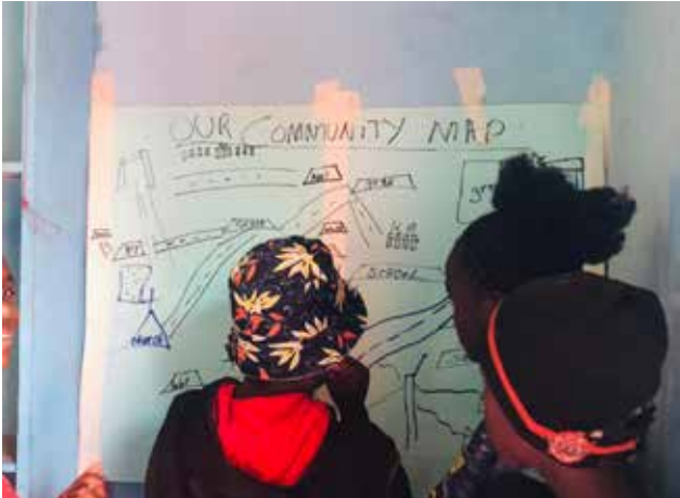
Figure 3 A group of girls jointly drawing a community map